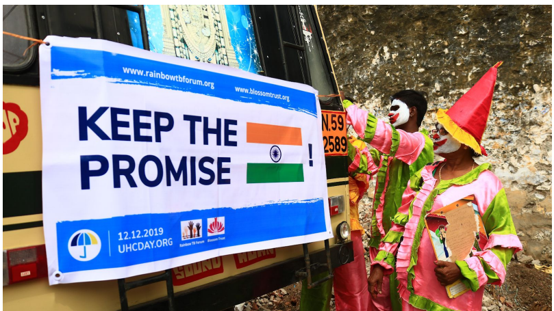
Blossom Trust, India